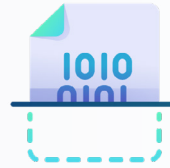
Internal bulk file scanning