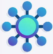
Centralized file processing services