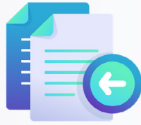
Bulk file imports