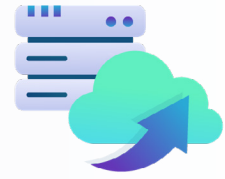
Platform migration to cloud